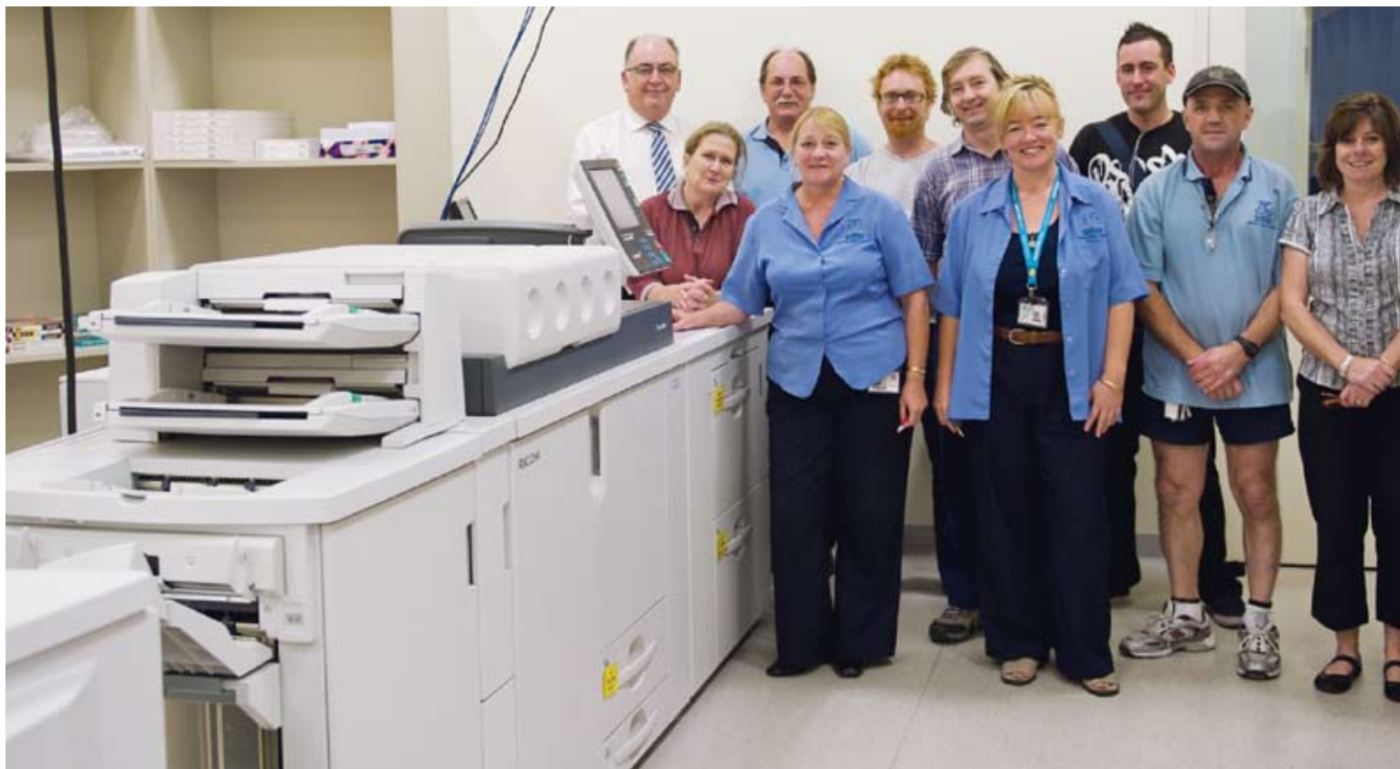
The Digital Print Centre staff with their Ricoh Pro C900